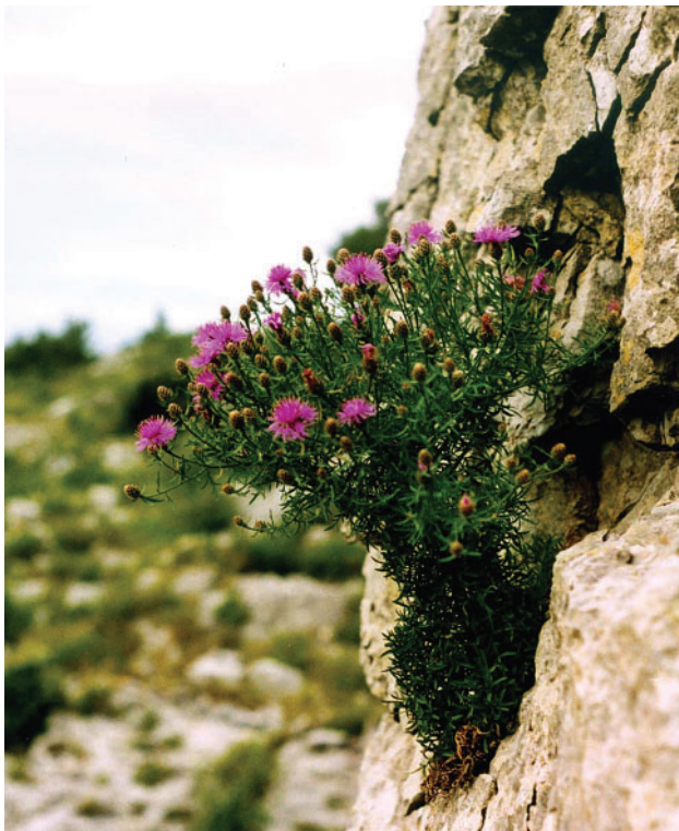
Fig. 3. Flowering individual of the narrow endemic Centaurea corymbosa growing in limestone outcrops in southern France. Multiple introductions from many source populations were most successful in creating new populations (Kirchner et al. 2006).

Close tracking of plants inherent in collecting data for a population viability analysis allows comparisons of potential population growth with and without translocations. The analysis of the endangered palm Pseudophoenix sargentii in the Florida Keys showed that reintroduced plants had faster maturation and higher population growth rates than did wild plants and that reintroductions have expanded the species range (Maschinski and Duquesnel 2007).